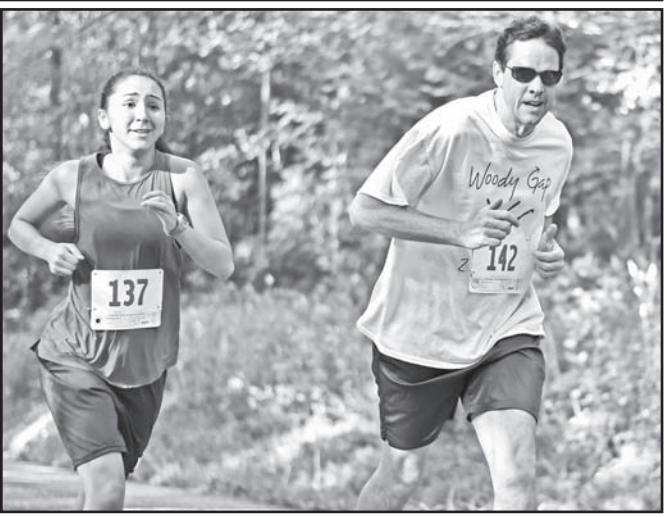
Last weekend's Run Above the Clouds 5K and 10K races featured plenty of local participants from the Blairsville and Suches area. Run Above the Clouds photos by Todd Forrest